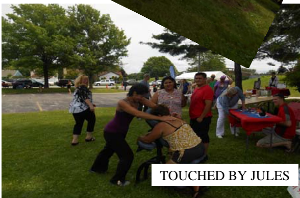
TOUCHED BY JULES