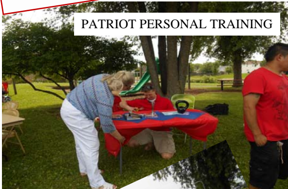
PATRIOT PERSONAL TRAINING

A very special thank you goes out to the following local businesses who participated in the picnic by hosting an information booth and/or donating a prize for the raffle. We appreciate doing business with you all!